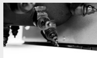
Teeth for working on concrete