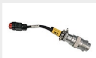
Wiring adaptors Wiring adaptors interface to allows a Plug & Play coupling with the most popular skid steers